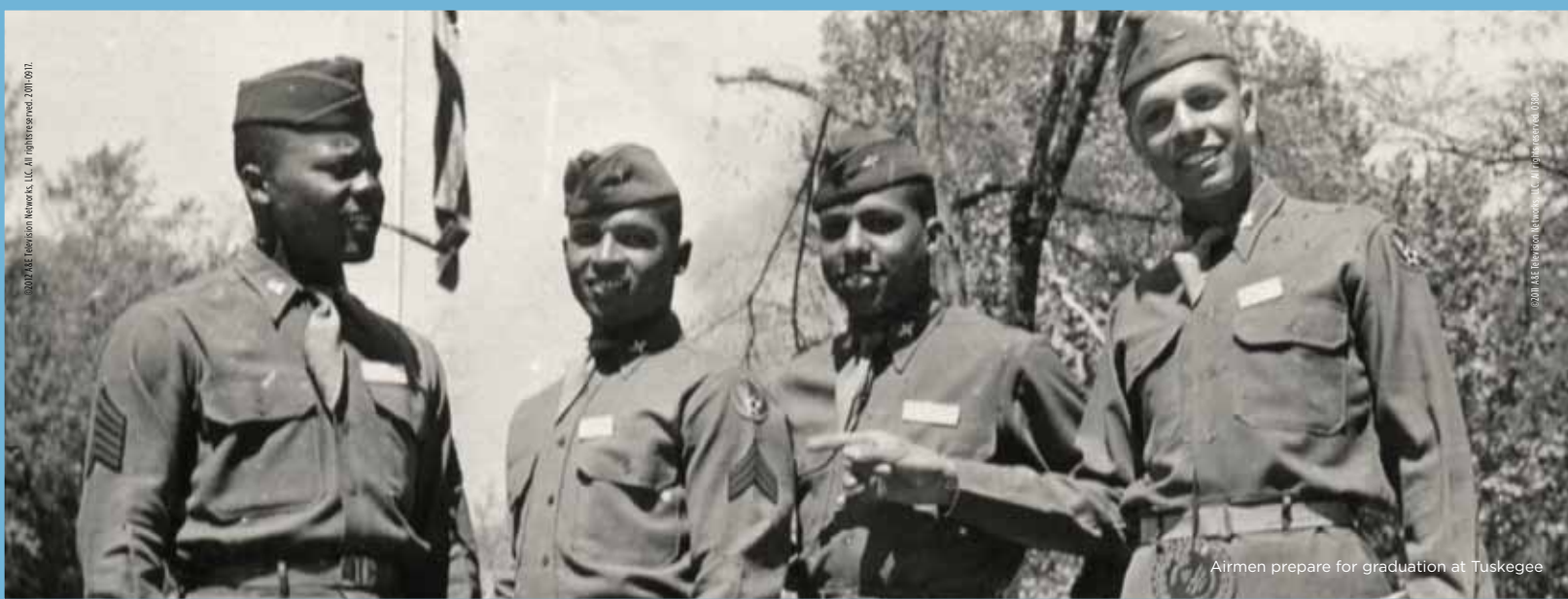
Airmen prepare for graduation at Tuskegee