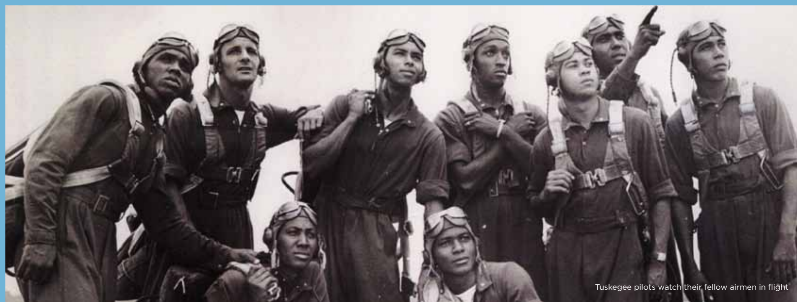
Tuskegee pilots watch their fellow airmen in flight