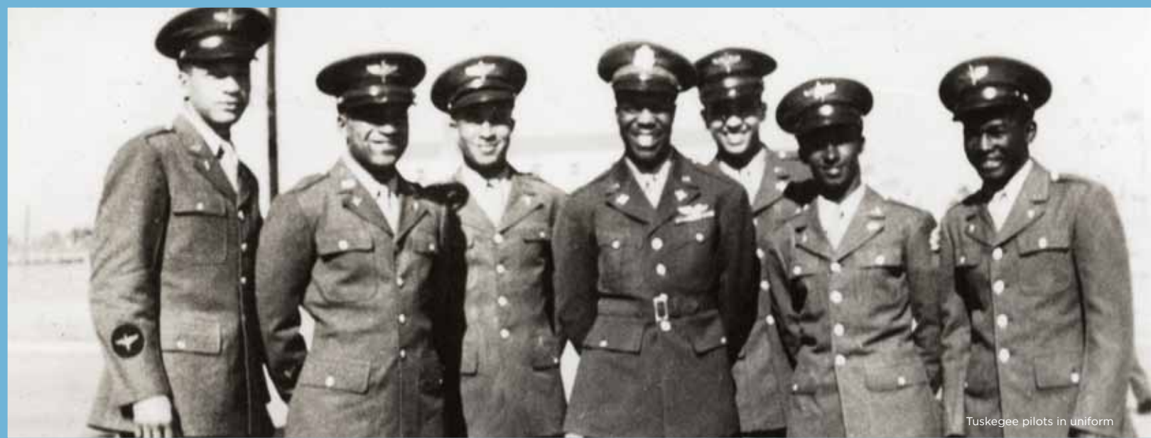
Tuskegee pilots in uniform