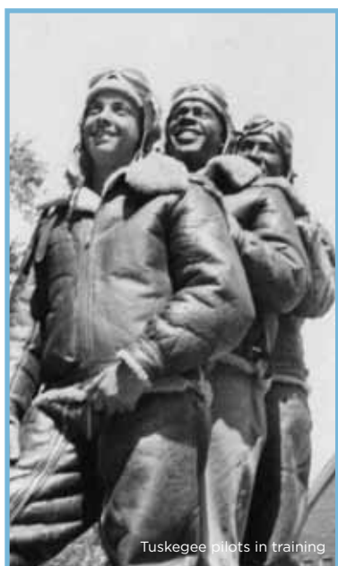
Tuskegee pilots in training

adversity court martial fascism menial mobilization segregation sortie state-sanctioned